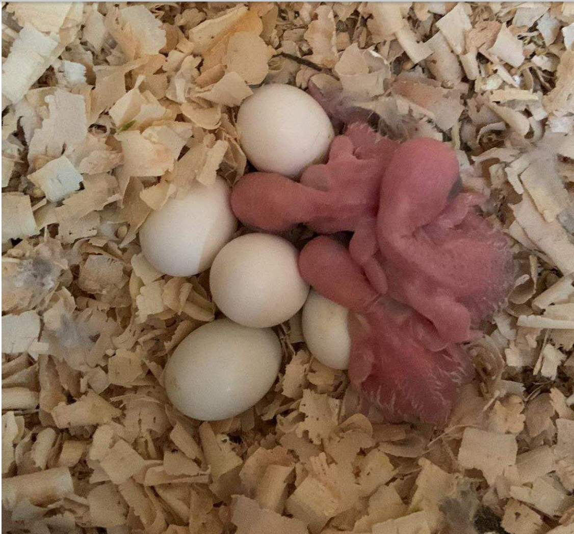
A healthy nest with clean substrate and healthy eggs, the bottom, darker egg is dead in shell, demonstrated by the darker, grey appearance rather than the pinky white of a healthy egg